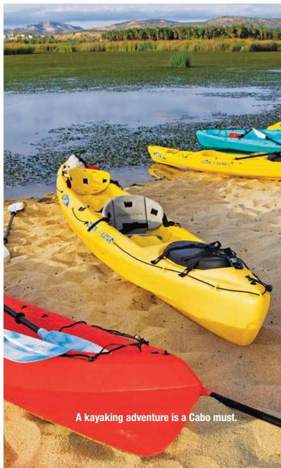
A kayaking adventure is a Cabo must.

MAKE AN EXCHANGE OR PURCHASE A GETAWAY AT INTERVALWORLD.COM.